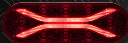
STL602RB - Tail Function

STL603RB – 12-LED, grommet mount, PL-3 connection, sonically sealed, waterproof