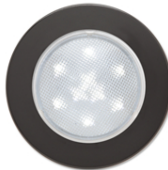
UCL09CB with A09BB trim ring