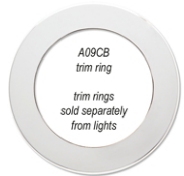
A09CB trim ring trim rings sold separately from lights