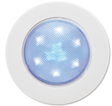
UCL09CBB with A09WB trim ring