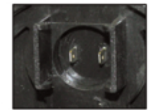
weather tight connection